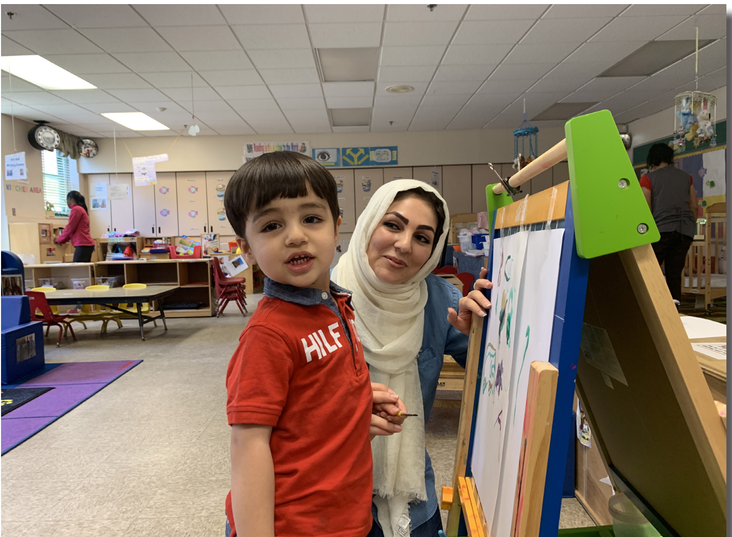
A mother and son learning together at the Adelphi Langley Park Family Support Center.

Funding for the network is provided by the Maryland State Department of Education, the U.S. Department of Health and Human Services, private foundations, corporations, and individuals.