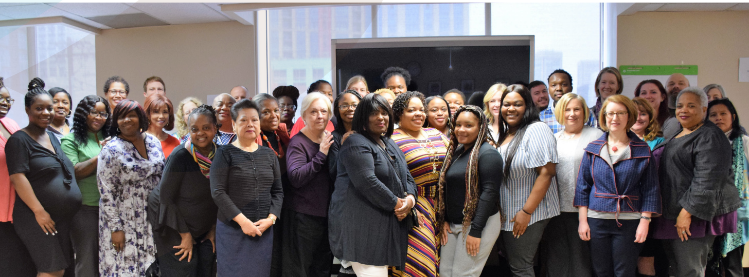
Maryland Family Network staff, 2019.